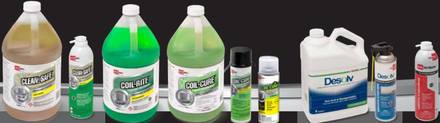
Condenser and Evaporator